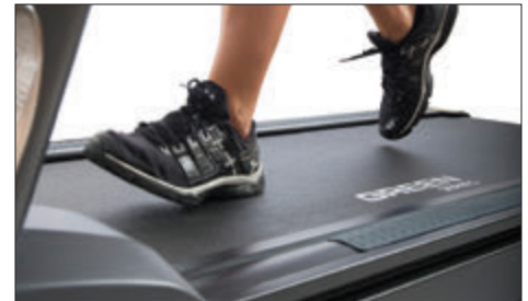
25,000 mile maintenance-free running belt