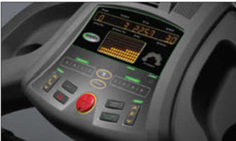
Intuitive, easy-to-use console