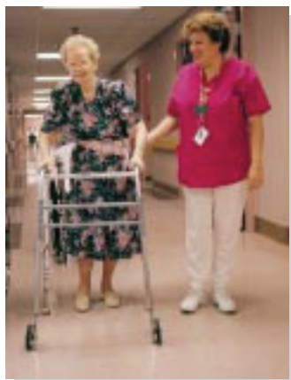
The Ageing Gracefully program restored independence to participants. This woman usually uses a wheelchair, however, strength training has allowed her the functionality of using a walker as well.