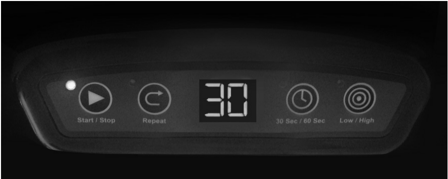
Personal Power Plate Remote Control