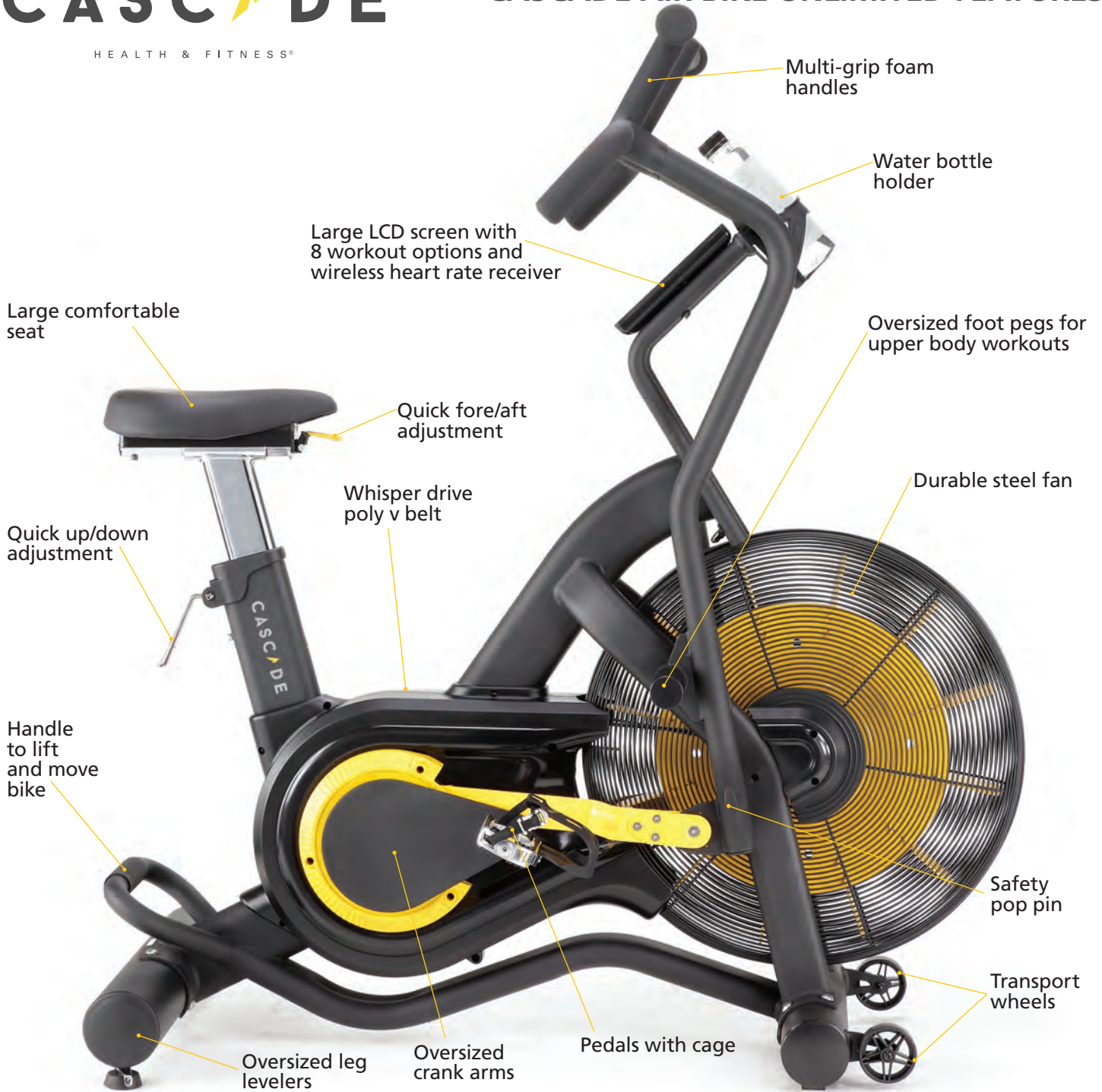
Cascade Air Bike Unlimited