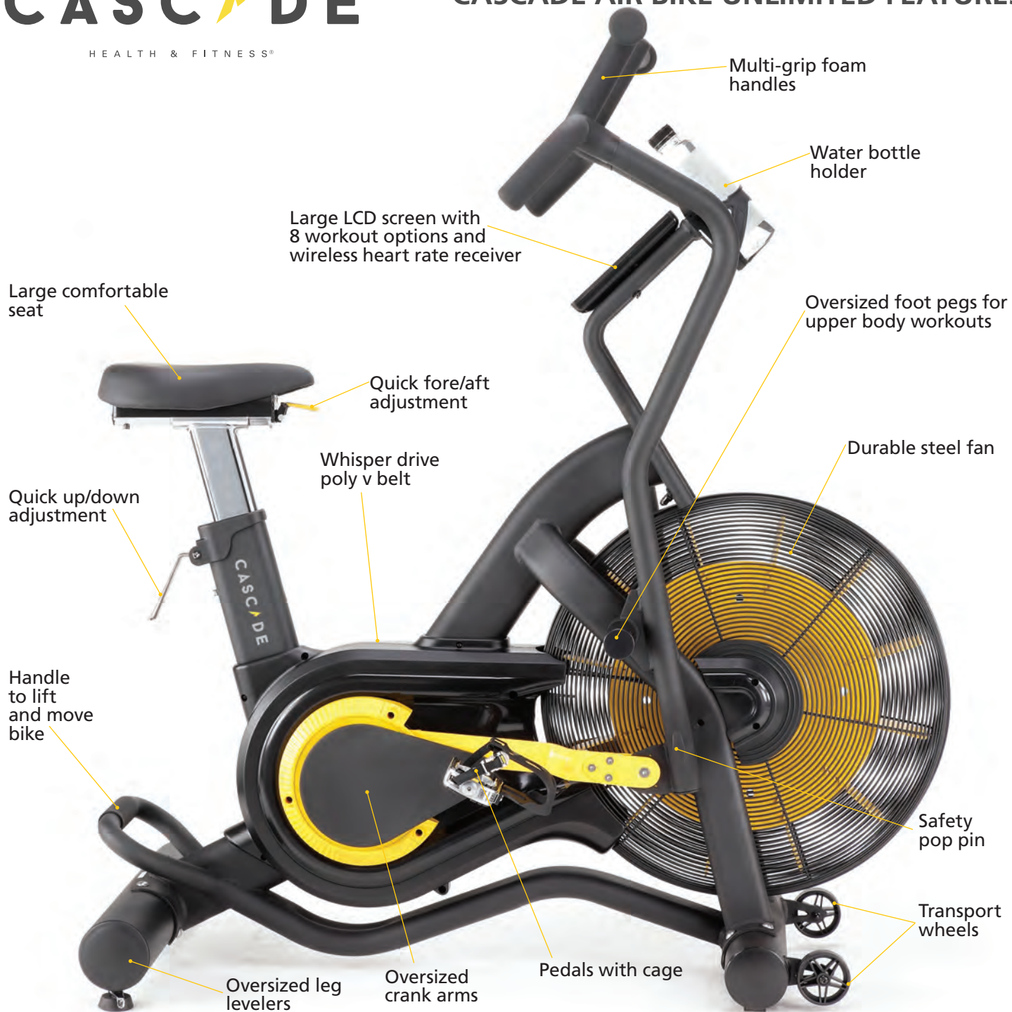
Cascade Air Bike Unlimited