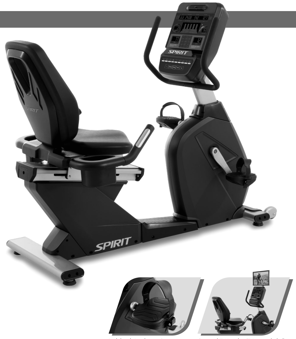
Pedal with Ratcheting Strap