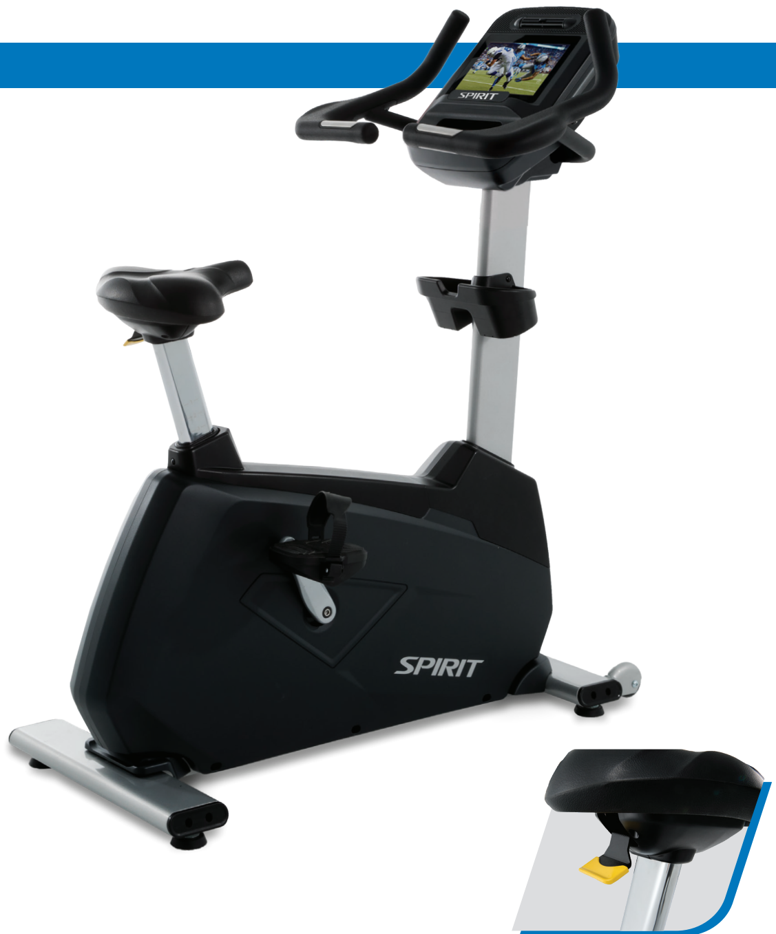
Easy Seat Adjustment

Users get the best of both in motivation and entertainment with the CU900ENT Upright Bike. The 10.1" touchscreen display allows users to watch TV, surf the internet and stream music while they work out. Three workout display modes give users plenty of feedback on their performance and progress. Commercial-grade pedals, cranks and bearings provide outstanding function and durability.