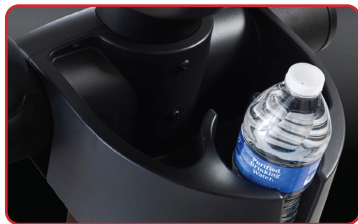
Large cup & accessories holder