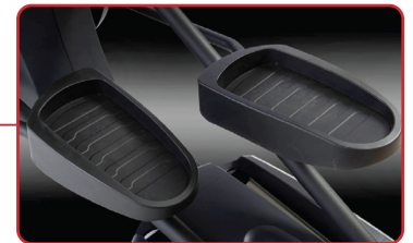
Heavy-duty steel frame with 20" natural stride