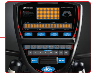
Intuitive, LED console with reading rack/tablet holder