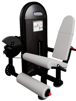
LEG EXTENSION 9NL-S1010