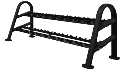
DUMBBELL RACK 10-PAIR/2 TIER 9NN-R8001