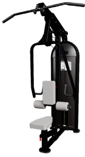
DUAL LAT PULL DOWN/VERTICAL ROW 9NL-D3340