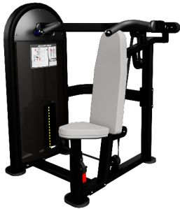
SHOULDER PRESS 9NL-S4100