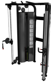
DUAL ADJUSTABLE PULLEY 9NL-D2002