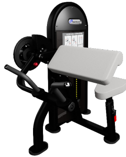
DUAL BICEPS CURL/TRICEPS EXTENSION 9NL-D5120