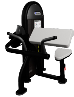
BICEPS CURL 9NL-S5100