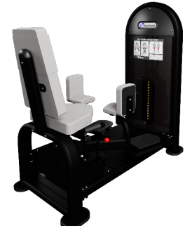
DUAL INNER/ OUTER THIGH 9NL-D1015