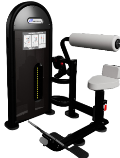
DUAL ABDOMINAL/LOWER BACK 9NL-D6330