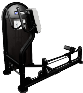
GLUTE PRESS 9NL-S1012