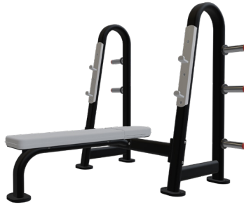
OLYMPIC FLAT BENCH 9NN-B7503