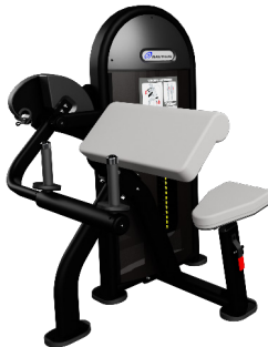
TRICEPS EXTENSION 9NL-S5110