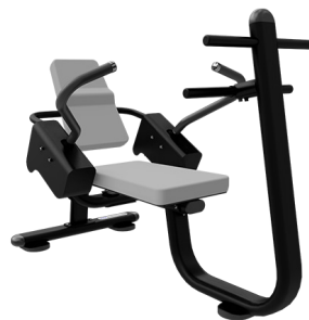
AB BENCH 9NN-B7505