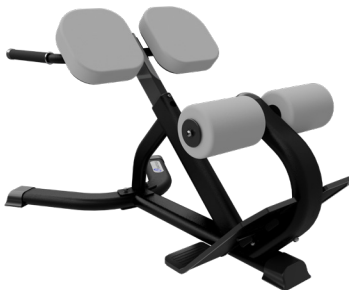
45 DEGREE BACK EXTENSION 9NN-B7502