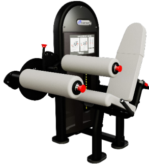
DUAL LEG EXTENSION/ LEG CURL 9NL-D1014