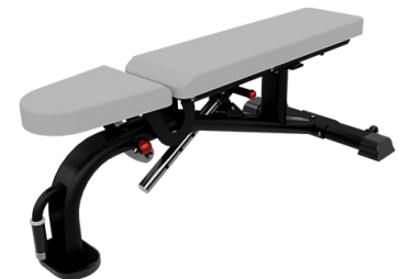
MULTI-ADJUSTABLE BENCH 9NN-B7501