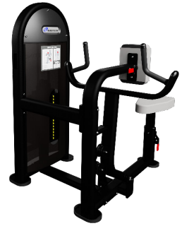
VERTICAL ROW 9NL-S3320