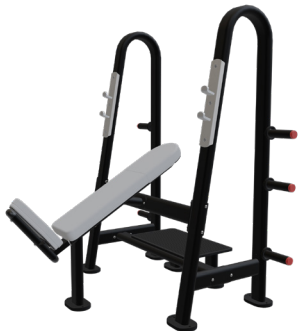
OLYMPIC INCLINE BENCH 9NN-B7201