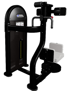
ROTARY TORSO 9NL-S6300