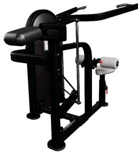
LAT PULL DOWN 9NL-S3310