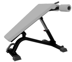
ADJUSTABLE ABDOMINAL DECLINE BENCH 9NN-B7200