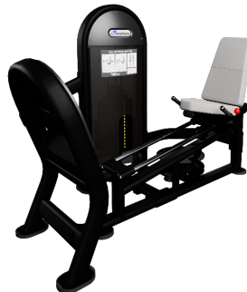
DUAL LEG PRESS/ CALF RAISE 9NL-D1013