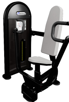
CHEST PRESS 9NL-S2100