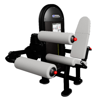
LEG CURL 9NL-S1011