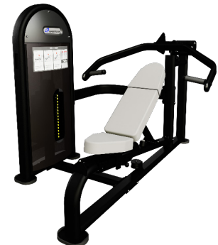
DUAL MULTI-PRESS 9NL-D2120