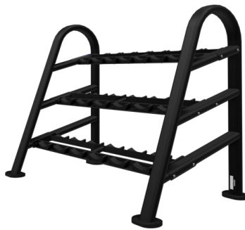
DUMBBELL RACK 10-PAIR/3 TIER 9NN-R8002