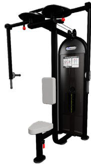
DUAL PECTORAL FLY/REAR DELTOID 9NL-D2110