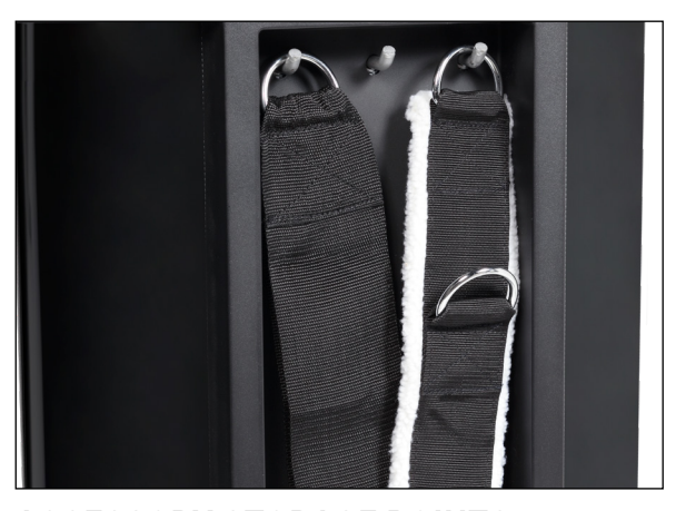
ACCESSORY STORAGE POINTS

A newly designed Internal Pulley Adjustment System with Quick-Release Adapters allow for easy one-handed adjustments while hiding hardware from view for a clean, sleek look.