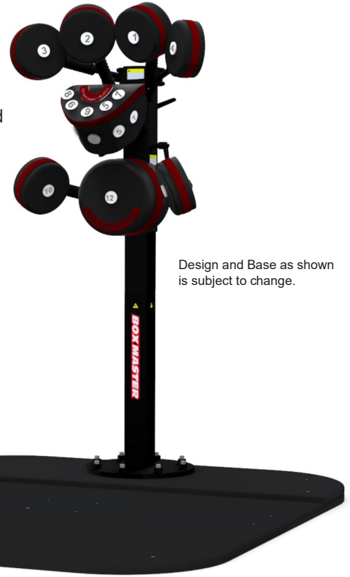
Design and Base as shown is subject to change.