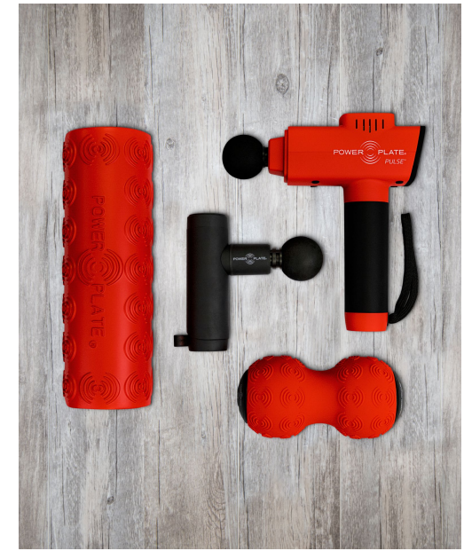
Visit powerplate.com to check out our other Targeted Vibration Products