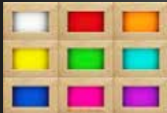
Oversized Interior Reading/Chromotherapy Lighting System

Pro 6 Saunas bring healthy living and longevity to the privacy of your home. Our innovative Carbon Tech Heat Emitter Panels are engineered to produce a wider, softer heat that is evenly distributed throughout the sauna. Our P6 Series Sauna models are constructed using Reforested Canadian Hemlock Wood and come in 1, 2, & 3 person capacities. These sauna models come with standard features such as Carbon Tech Low EMF Heat Emitter Panels, Dual Control Panels on most models (single Control Panel on P6-H356-01), Floor Heater, Exterior Ambient Lighting, FM/CD Player, Privacy Bronze Tempered Glass, Roof Vent, and more.