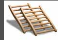
Optional Backrests (sold in pairs)