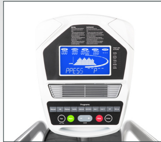
Download displayed workout metrics