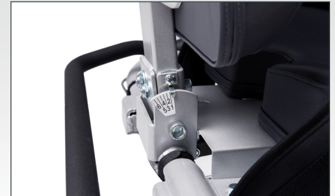
Seat rotates, adjusts horizontally and reclines