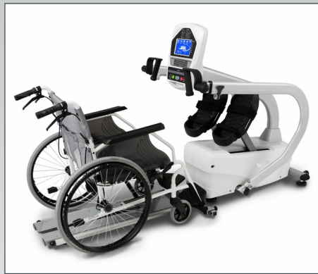
Direct wheelchair access

This machine is fully compliant with the Americans with Disabilities Act (ADA) to ensure accessibility for the widest range of disabilities.