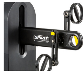
Multi-function handle with rotating hand grips, remote shortcut keys and arm height adjustment lever.