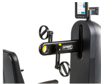
Adjustable crank arm length for patients with limited mobility