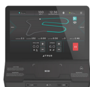
UNITE 16" TOUCHSCREEN