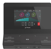
UNITE 10" TOUCHSCREEN