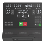
UNITE LED CONSOLE