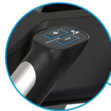
Easy-access quick-touch keys